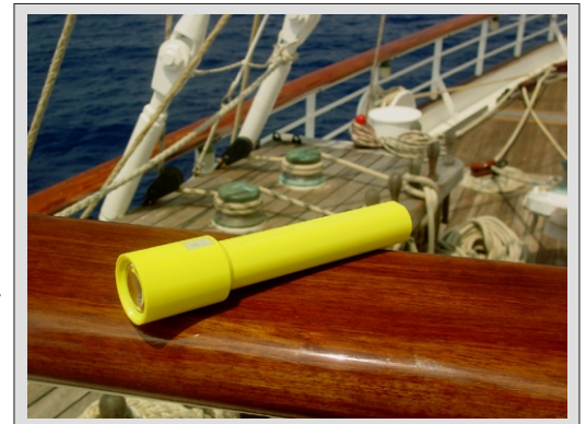
Marine Yellow NightStar UPC# 81034600 SKU# 002 NSN# 6230-01494-0585

U.S. Patents: 5,975,714 Issued November 1999 / 6,220,719 Issued April 2001